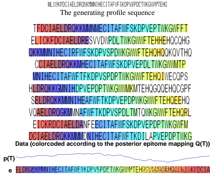
Figure 1: The epitome (e) learned from data synthesized from the generating profile sequence (Section 5). A color coding in the epitome and data sequences is used to show the mapping between epitome and data positions. A white color indicates that the letter was likely generated from the garbage component of the epitome. The distribution p(T) shows which 9mers from the epitome were more likely to generate patches of the data.